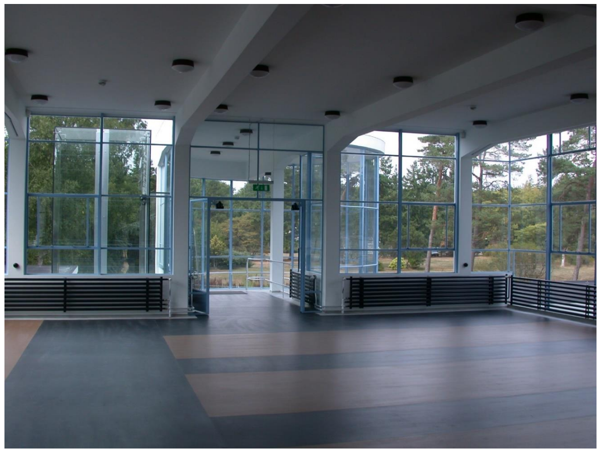
Sanatorium Zonnestraal, Hilversum (The Netherlands), archs. Duiker&Bijvoet, 1928

Having initiated an online discussion at the Tokyo Congress in 2021 'Modernism Frozen, Urbanism and Architecture under/after Covid-19: Learning from Modern Movement Interiors in Times of Pandemic'*, organized by Docomomo International, it was clear that the short and long term and small and large-scale effects necessitated further discussion as new pieces of information were discovered. These are some of the questions that may expand the dialogue: