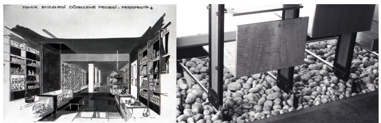
Pamuk Pharmacy (Pamuk Eczanesi) by Önder Küçükerman, interior perspective drawing (left) and shelf detail photograph (right), Istanbul (Turkey), 1968 and ©: Önder Küçükerman and DATUMM: Documenting and Archiving Turkish Modern Furniture Archives (datumm.org)

DOCOMOMO International re-announces the Call for Abstracts for a special issue of the Docomomo Journal dedicated to the functioning and experience of the modern interior in times of crisis, showcasing a variety of insightful perspectives from around the world. The Covid-19 pandemic has made us more aware of our intricate relationship to the natural environment and the need for a wide range of strategies to tackle a common issue. These are themes which directly relate to qualities of the Modern Movement and may inspire an expansion of existing discussions.